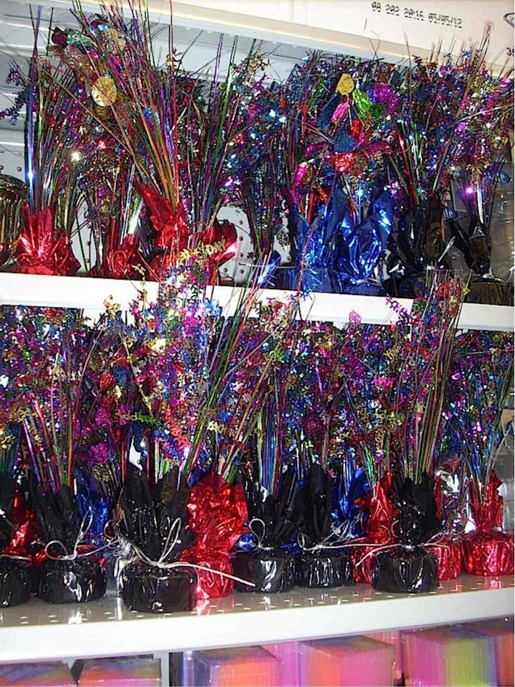
Who would actually buy...: The Happy Birthday Balloon Weight? Evidently, hockey pucks occasionally need to attend parties deep undercover as hideous “balloon weights.”